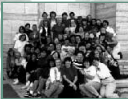
The Peninsula Women's Chorus, 1999

The purpose of this book is to inspire. Whether you are a choral conductor, a composer, or a singer in a choir, we hope that these materials will reveal possibilities you had not considered before. It includes essays by composers and excerpts of their pieces, with information about how you can obtain copies; there is even a CD of full performances of many of the pieces. There is also a lot of practical information about what it takes to run a chorus, as well as commentary about the spiritual side of drawing a group of singers together into a choir.